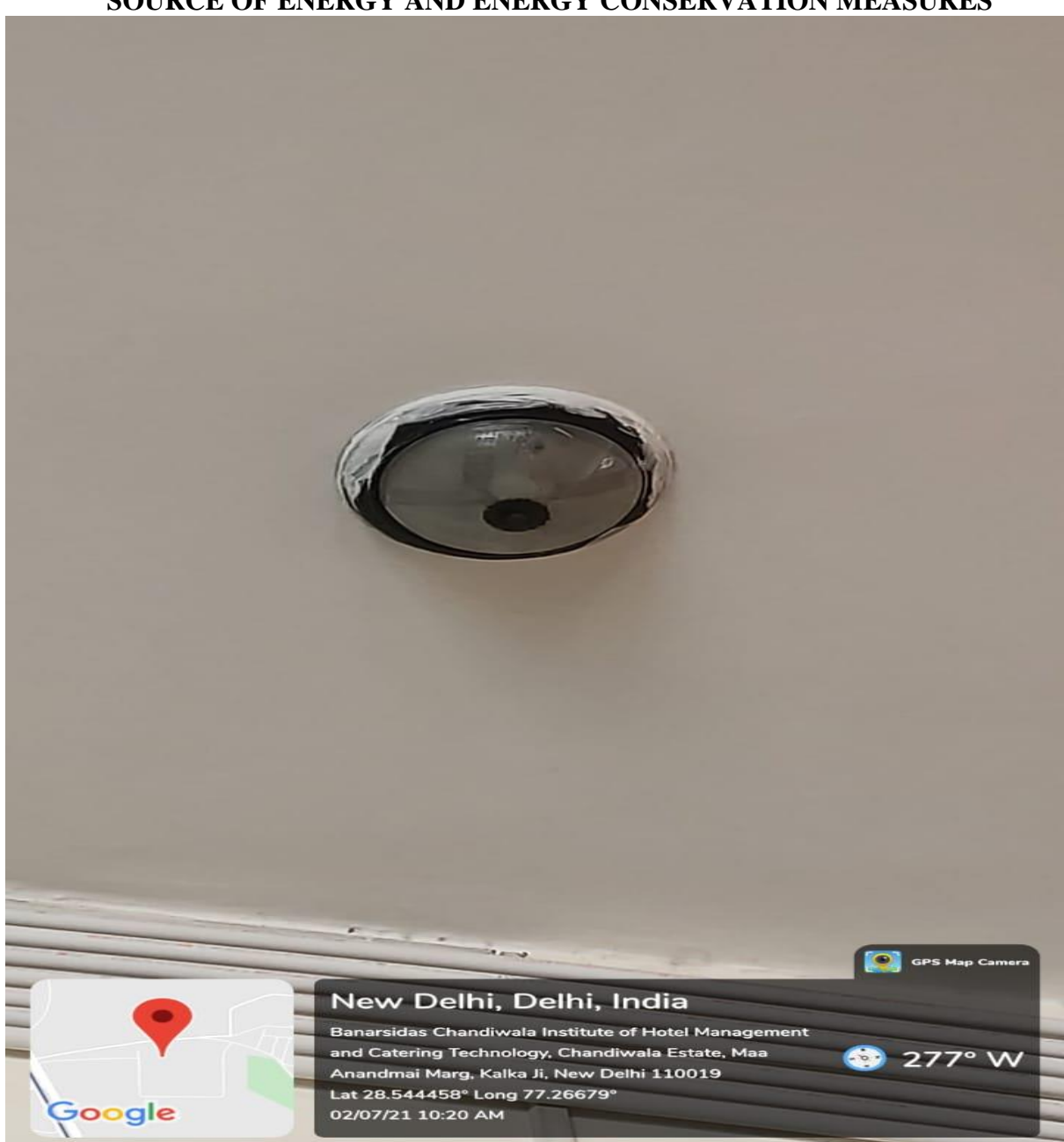
7.1.2 SOURCE OF ENERGY AND ENERGY CONSERVATION MEASURES