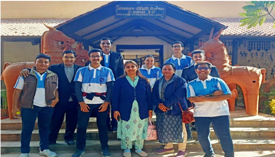
On December 13, 2022, a field trip to the National Art Museum was conducted.