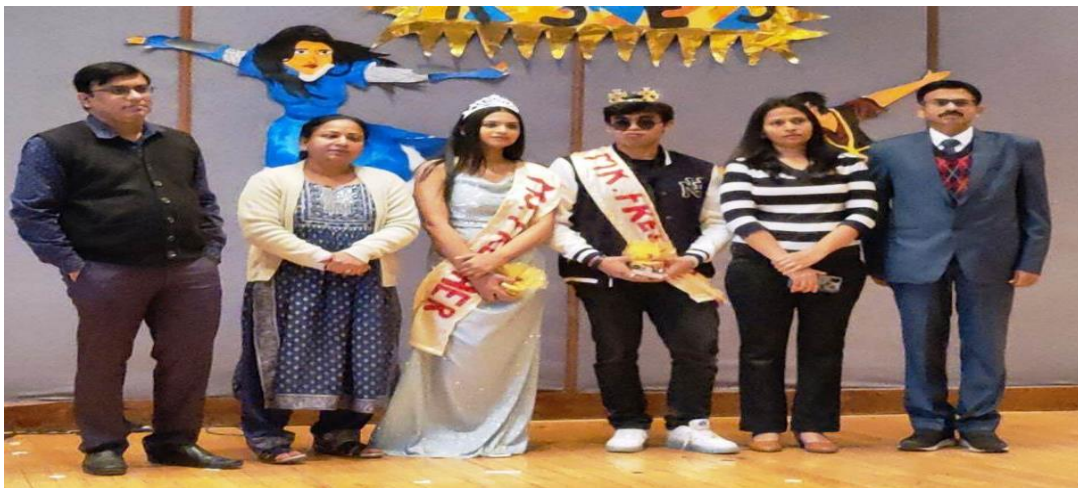
On December 17, 2022, the Fresher's Party was hosted by the BanarsidasChandiwala Institute of Hotel Management and Catering Technology.