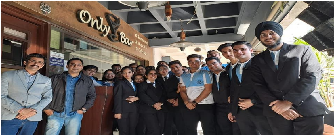
A trip to Only Bar in Nehru Place, New Delhi, on December 13, 2022