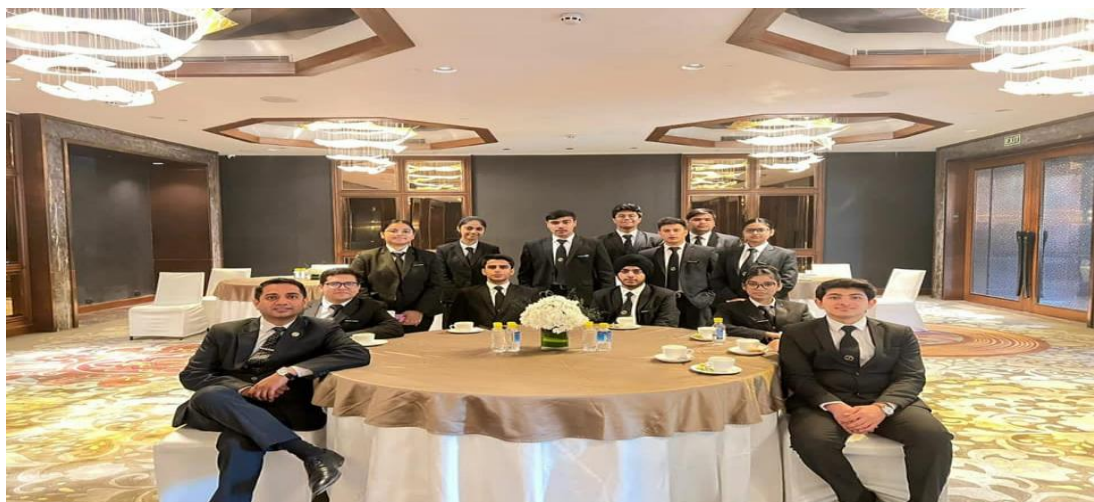
The Roseate, Samalkha ON December 6th, 2022.