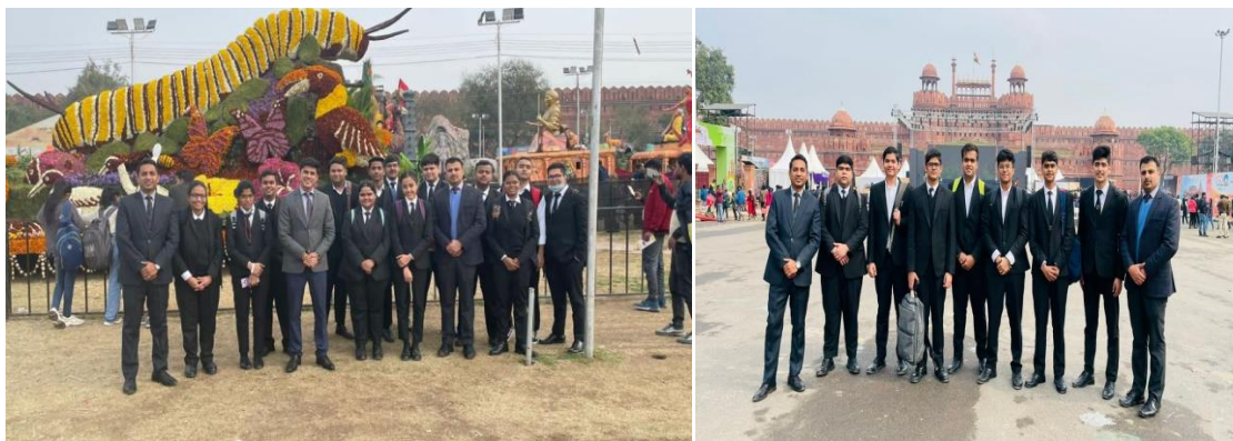
BanarsidasChandiwala Institute of Hotel Management and Catering Technology organized a field trip to Red Fort, New Delhi on January 30, 2023 on the occasion of Bharat Parv.