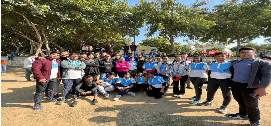
The 17th Annual Sports Meet of Guru Gobind Singh Indraprastha University was held on the University campus from December 14 to December 16, 2022.