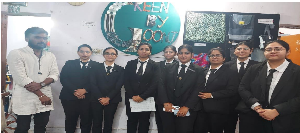
Students enthusiastically contributed, under the Odha do Zindagi Campaign and packed the items which were to be donated and delivered at 'Goonj', New Delhi. The visit was organized on Dec 07, 2022.