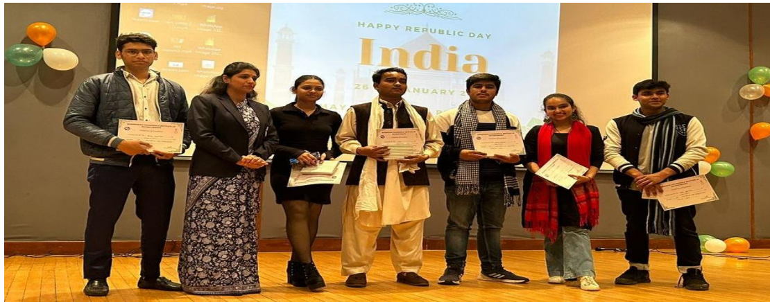
Students of BCIBMCT participated in the Skit Competition organized by BANARSIDAS CHANDIWALA INSTITUTE OF PHYSIOTHERAPY on January 25, 2023