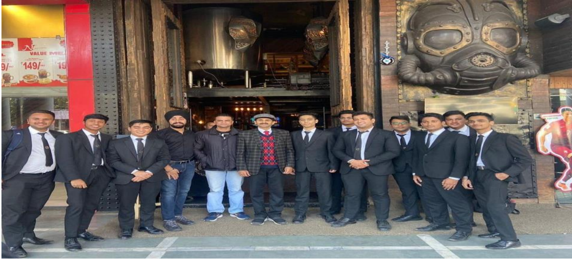
Ministry of Beer, CP, New Delhi (FIRST MICROBREWERY OF DELHI) organized a trip to educate students of BCIHMCT on December 13, 2022.