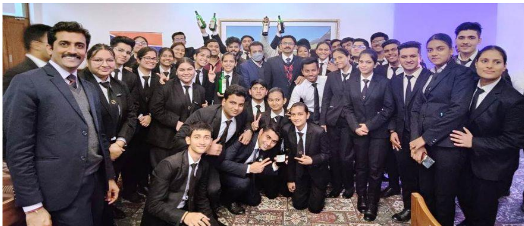
Tulleho Beverage Academy to conduct a workshop for second year students on Wine Appreciation on December 19, 2022