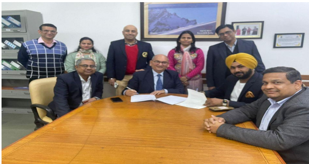
BanarsidasChandiwala Institute of Hotel Management and Catering Technology signed Memorandum of Understanding with Royex Hospitality Pvt. Ltd- New Delhi (RH) on February 08, 2023.