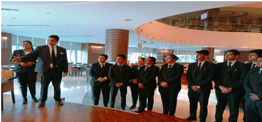
Crowne Plaza, Greater Noida on December 14, 2022