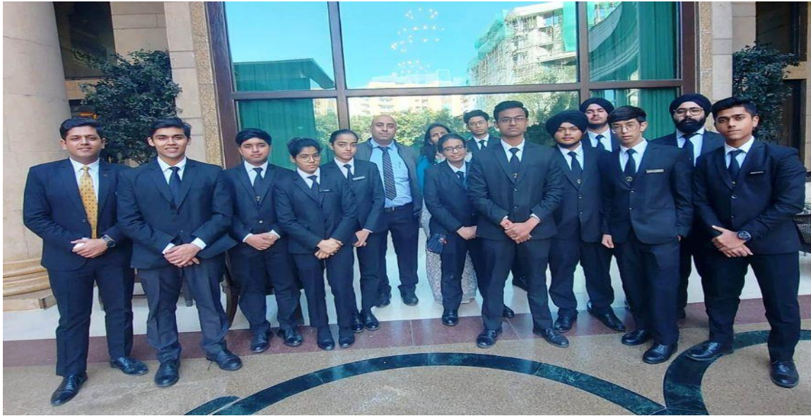
The Leela Palace New Delhi for an Industrial Visit on December 13th, 2022